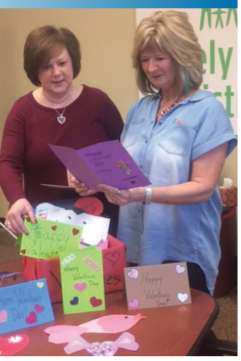
Valentine's Day cards for MOW clients

Shively Area Ministries is an equal opportunity organization.