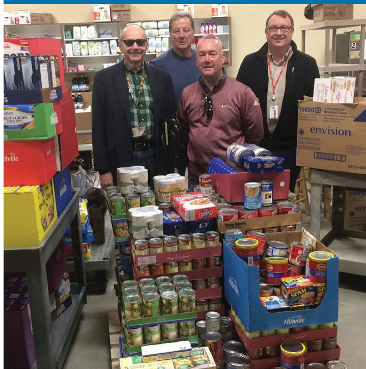
UPS delivering canned goods

To deliver donations, call Joe at (502) 447-4330 x27 Or drop by M-F, 9 a.m. – 12:30 p.m. (closed first Monday each month)